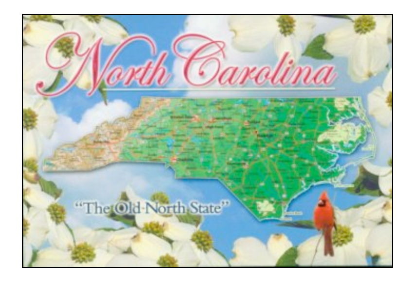
fig. 2: Postcard of North Carolina [click image to enlarge]

This postcard map of North Carolina, though detailed, is functionally close to useless. Scaled beyond any navigational utility, it is a statement of roadways, of development, of things that pass in and out. A place you are meant to recognize from other maps, I think, and not from your own afternoons in its graveyards. No, here it is just the idea of rivers linked to lakes, of paths that diverge and connect and stay where you left them. The reverse of this postcard is much the same, a note from a friend looking for jobs, apartments, wondering whether to really leave our shared Chicago to follow a man. There's a sense of general direction in her writing, but it seems to fail her in the details, in the final turns that would take her home.