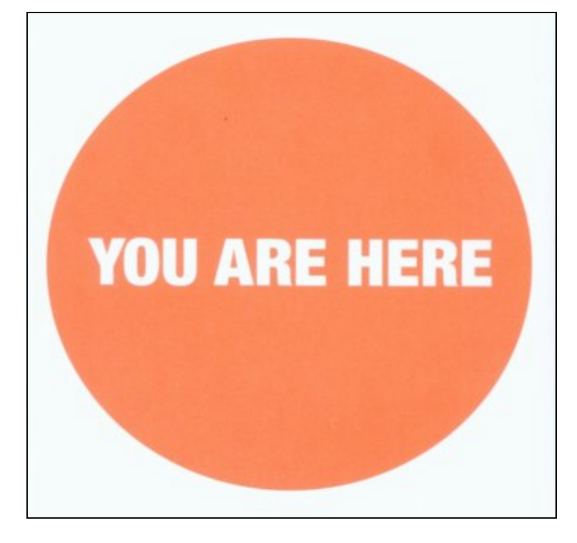
fig. 4: Envelope design for "Festival of Maps" in Chicago, Illinois [click image to enlarge]

You are here. Of course you are. And it's comforting, even if it's a lie, the very gap between you and the words you're reading are distance enough to invalidate the statement. But we won't quibble, not when you've been so kindly included, not when someone has anticipated that you should be looking to find your way and has made the effort to affirm, with great forethought, and authority, that wherever you may be heading, yes indeed, you are here. And what more could a map of exhibitions about maps tell you? What more could a whole city worth of maps say? And what more could you need to hear?